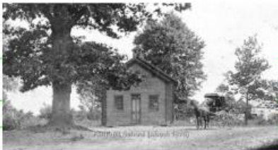
Fairfax Public Schools 1870

1873: Second Oakton Schoolhouse opens; built at the corner of Hunter Mill Rd and Rt 123, it is later moved and converted to a residence.