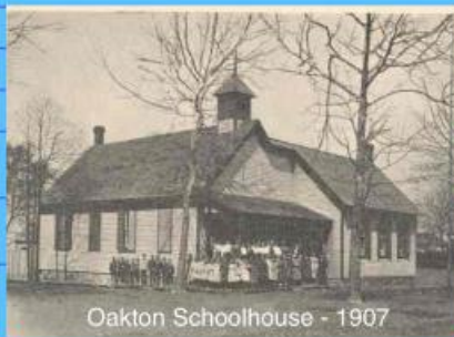
Oakton Schoolhouse - 1907

1876: Coal is discovered in southwestern Virginia.